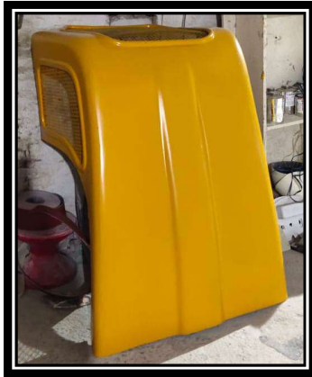
FRP BACKHOE BONNET